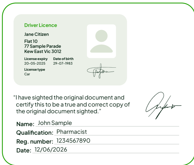
Photocopy of identity with certification

The example below shows how a certified copy of your proof of identity should look.