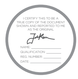
PHOTOCOPY OF ID WITH CERTIFICATION