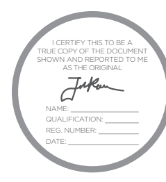
PHOTOCOPY OF ID WITH CERTIFICATION